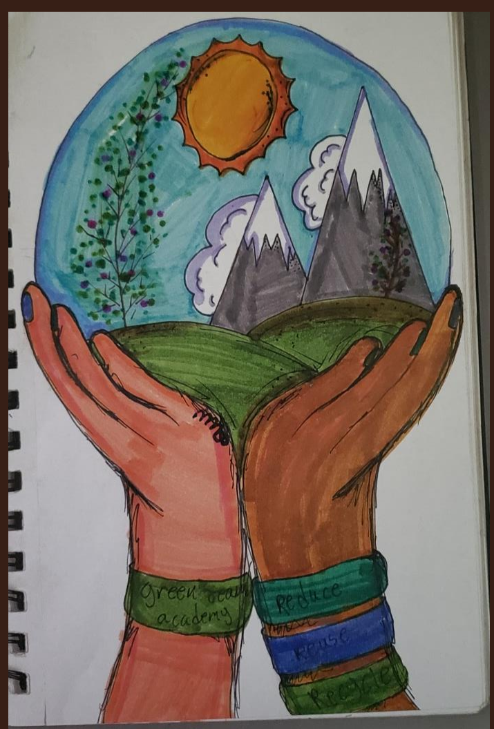
Logo created by Knowlton Township Elementary School 6th grade class